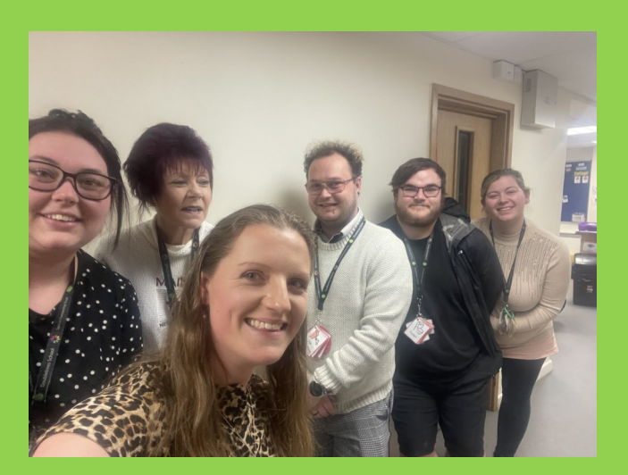
Little Orchard team photo