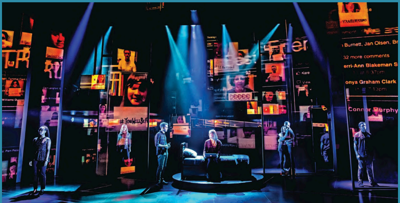
The original Broadway company of Dear Evan Hansen .

Choose a supporting character from the musical. Write a journal entry (or song, if you are feeling ambitious!) in his/her voice, conveying his/her emotions once Evan has revealed the truth.