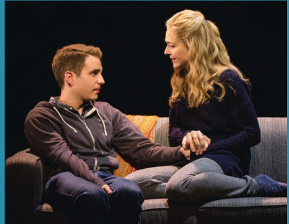
Ben Platt as Evan Hansen with Rachel Bay Jones as Heidi Hansen, his mother (Original Broadway Cast).

In addition to being a performer, I always wanted to be in the pit orchestra, playing piano or percussion. I always saw myself being involved on the musical side of things in musical theater. I just figured it would be interpreting and teaching and working out other people's music. I hadn't really planned on it being my own music. [As told to Metro Weekly ]