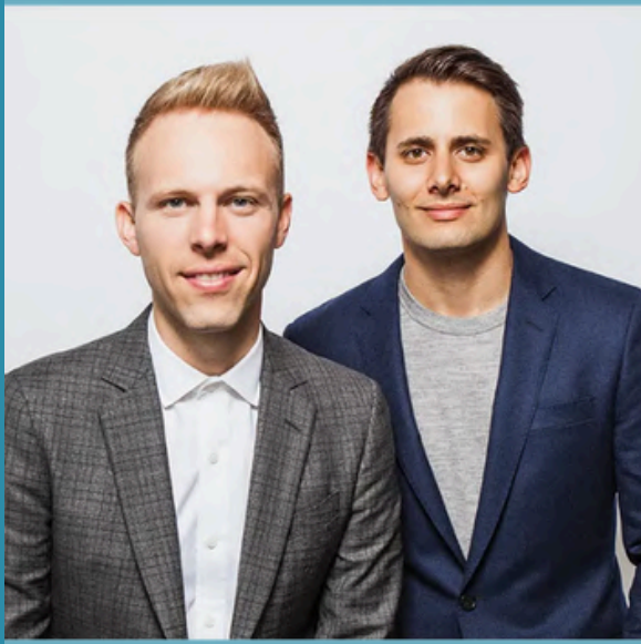
BENJ PASEK & JUSTIN PAUL

The American song writing duo's work include A Christmas Story, Dogfight, Edges, Dear Evan Hansen, and James and the Giant Peach. Their original songs have been featured on NBC's Smash and in the films La La Land, for which they won both the Golden Globe and Academy Award for Best Original Song for the song "City of Stars", and The Greatest Showman. Their work on the original musical Dear Evan Hansen has received widespread critical acclaim and earned them the 2017 Tony Award for Best Musical and Best Original Score. In 2022, they won the Tony Award for Best Musical for serving as producers for the Broadway production of Michael R. Jackson's Pulitzer Prize-winning musical A Strange Loop.