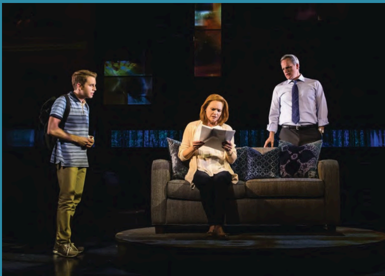
Ben Platt with Jennifer Laura Thompson and Michael Park as Mrs. and Mr. Murphy (Original Broadway Cast)

DISCUSS: How do you feel? Is the persona you project through social media the real you? Why or why not? Do you behave differently on different forms of social media? Snapchat, Twitter, Instagram — and how about on your Finsta account?