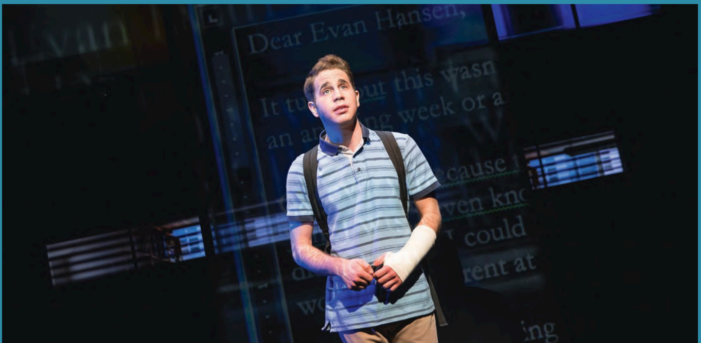
Ben Platt as Evan Hansen (Original Broadway Cast)

YOU WILL BE FOUND YOU WILL BE FOUND YOU WILL BE FOUND YOU WILL BE FOUND