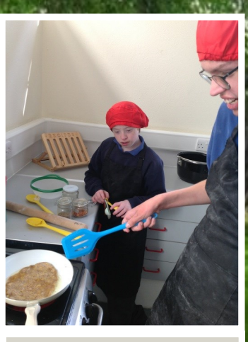
Cherry Class - We made an Autumnal pumpkin parathas in our 'Design Technology' class!