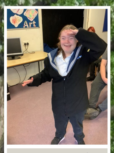
Elm Class - We had fun Learning about the Royal Navy and dressing up in our 'work related leaning' topic this week!