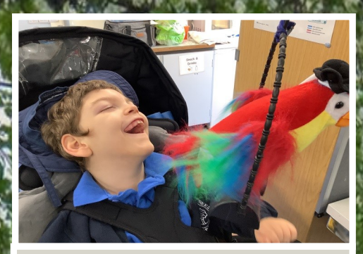
Rowan Class - We are learning about 'Cause and Effect' with sensory toys, kindly donated by a Rowan parent. Thank you!