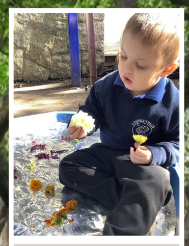
Oak Class - In our 'Understanding the World' lesson, we have been exploring natural items using our senses. We had an Autumn theme this week!