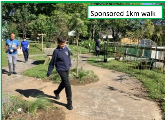
Sponsored 1km walk