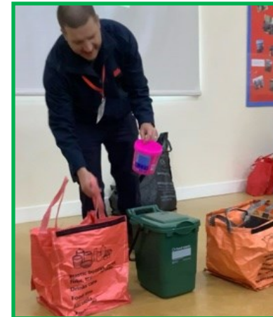
Biffa recycling workshop