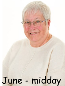
June - midday supervisor